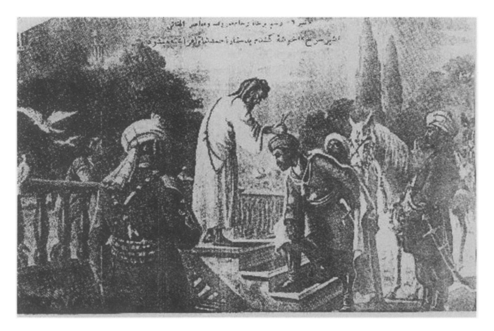
Figure 1. "Coronation" of Ahmad Khan Abdali. Translation of captions at top: No. 6. Drawing by Breshna, the famous contemporary Afghan artist. Sher-e Sorkh: The cluster of wheat is being placed on Ahmad Shah's turban.

Source: Mir Gholam Mohammad Ghobar, Ahmad Shah Baba-ye Afghan, facing page 90.